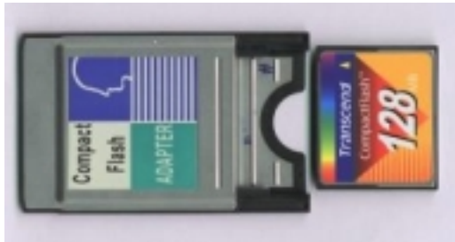
Figure 1. CompactFlash/PCMCIA Adapter